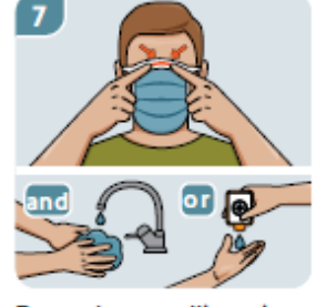
Press the metallic strip again so it moulds to the shape of your nose, and wash your hands again.