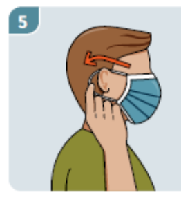
Put the loops around each of your ears, or tie the top and bottom straps.